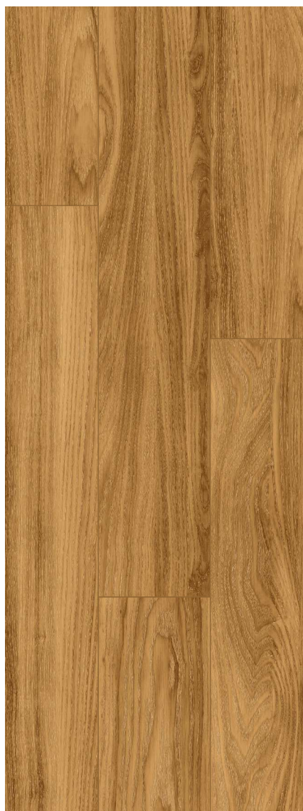
PARKHURST OAK 181x1220mm