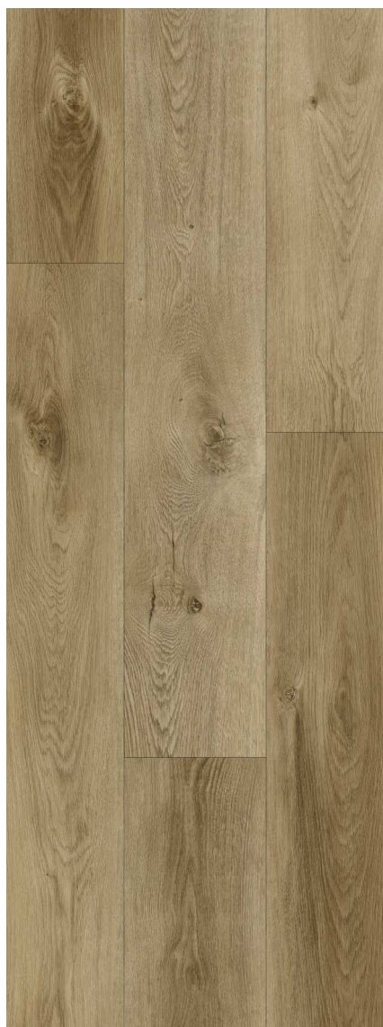
OAK ELEGANT 181x1220mm