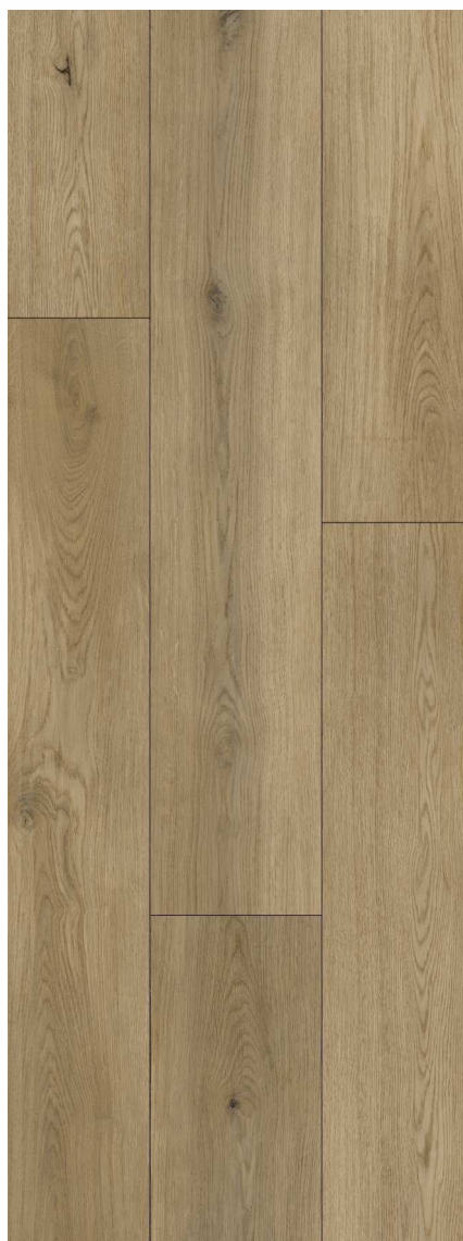
CLASSIC OAK 181x1220mm