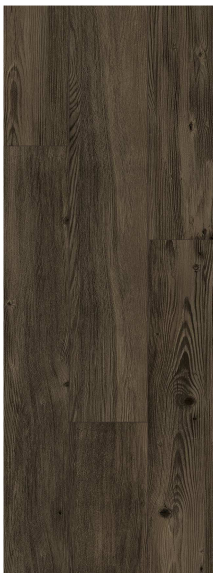
PINE CHARCOAL 181x1220mm