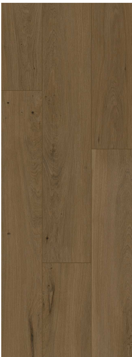
VINTAGE OAK 181x1220mm