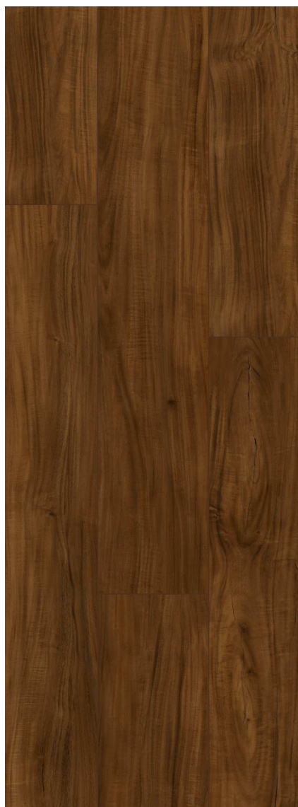
ACACIA DARK 181x1220mm