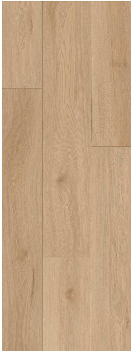
WARM OAK 181x1220mm