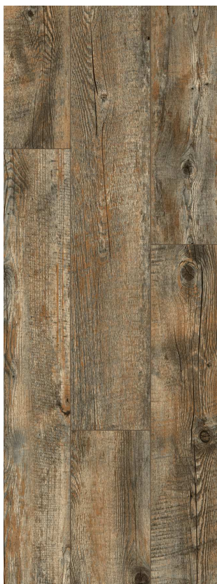
BOSTON NATURAL 181x1220mm