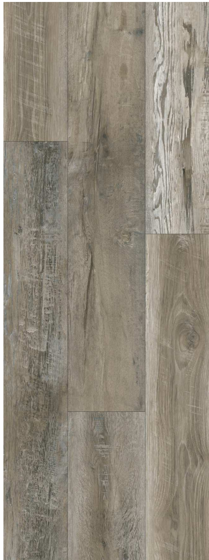
ASH MIX 181x1220mm