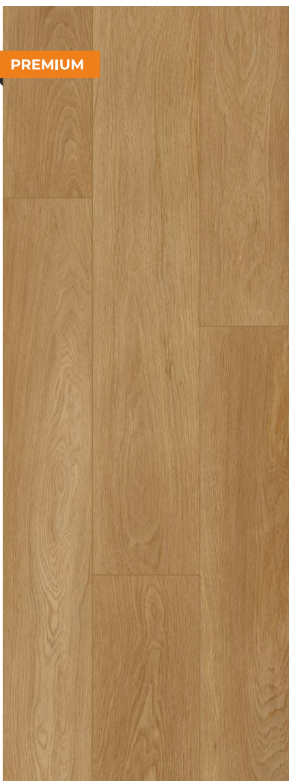
NATURAL OAK 181x1220mm