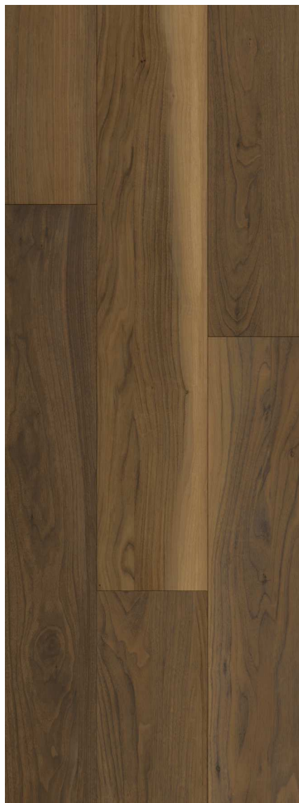
NATURAL WALNUT 181x1220mm