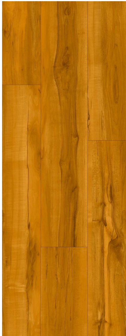
MAPLE BROWN 181x1220mm