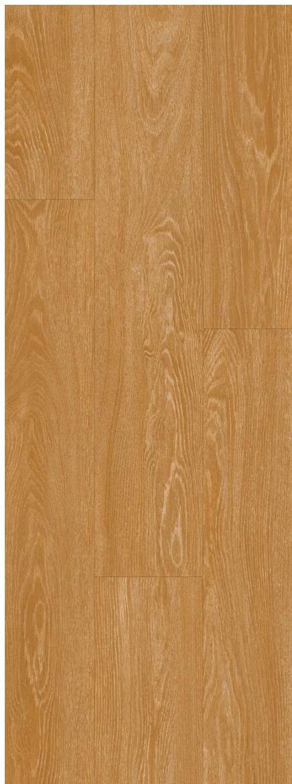
FANCY OAK 181x1220mm