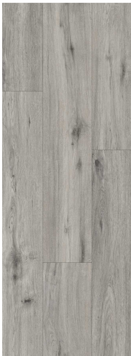
GREY OAK 181x1220mm