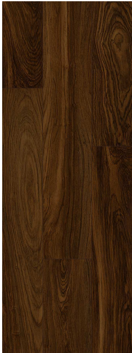
DARK PADAUK 181x1220mm