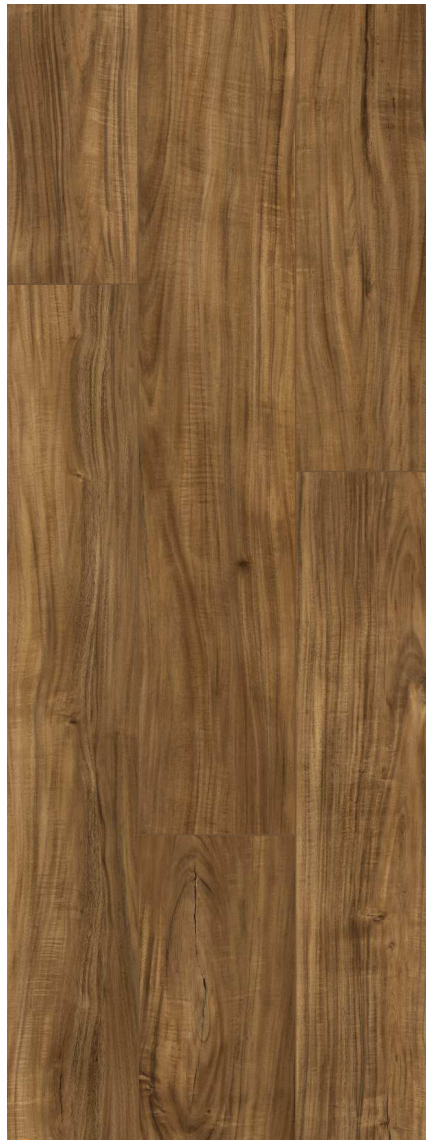
ACACIA BROWN 181x1220mm