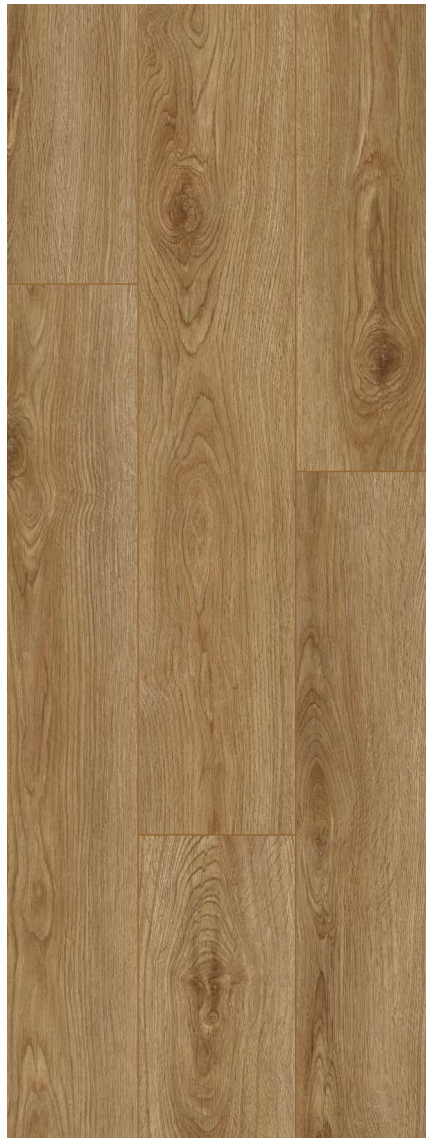
CHARWOOD OAK 181x1220mm