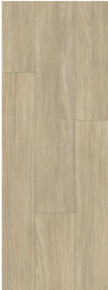
SANDY OAK 181x1220mm