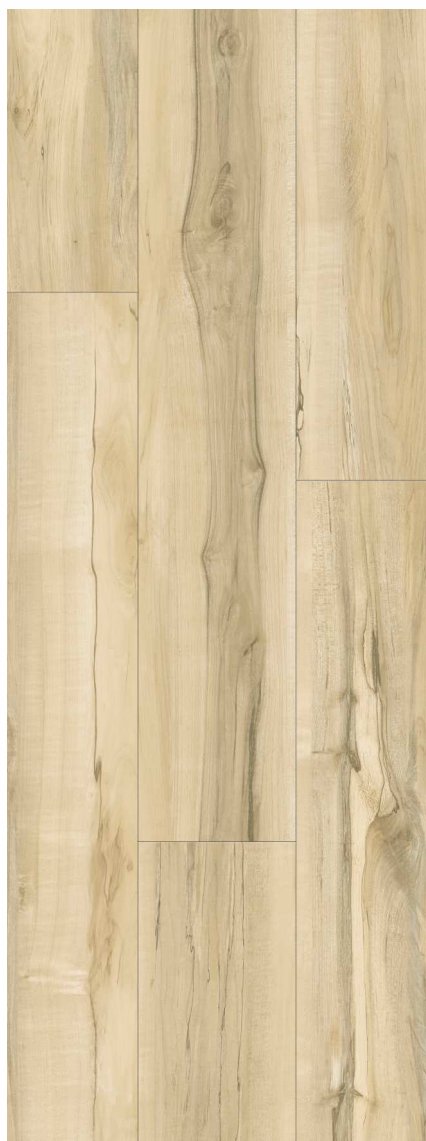
MAPLE BEIGE 181x1220mm